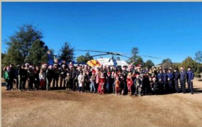
2022 SWH EVENT